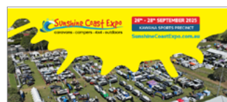
Facebook Cover 2