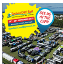
Social Media Post 2