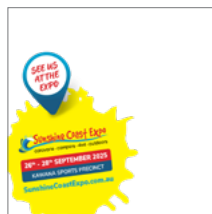
Social Media Post Template 2