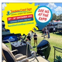
Social Media Post 1