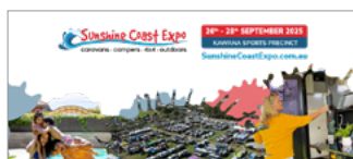
Facebook Cover 1