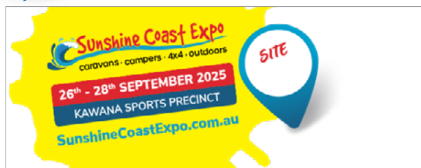
Email Signature Template 1