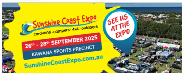
Email Signature 1