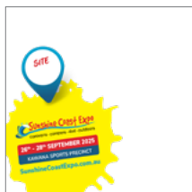
Social Media Post Template 1