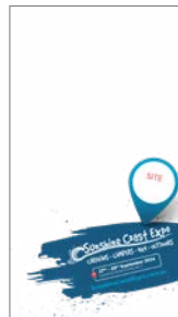
Social Media Story Template