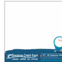
Social Media Post Template 2