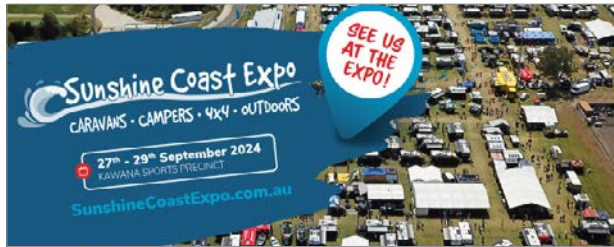
Email Signature 1