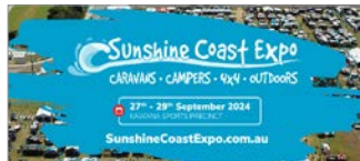
Facebook Cover 1