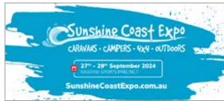
Facebook Cover 3