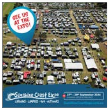
Social Media Post 1