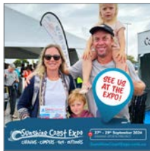
Social Media Post 2