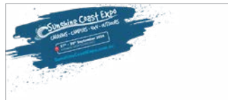
Facebook Cover Template 2