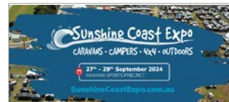
Facebook Cover 2