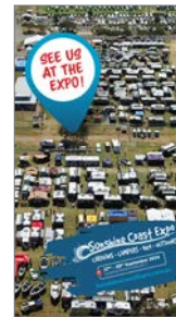
Social Media Story