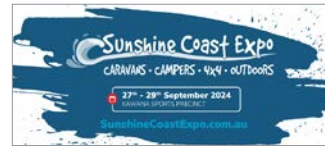
Facebook Cover 4