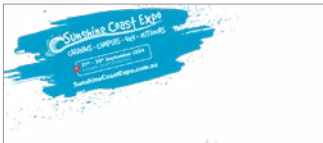
Facebook Cover Template 1