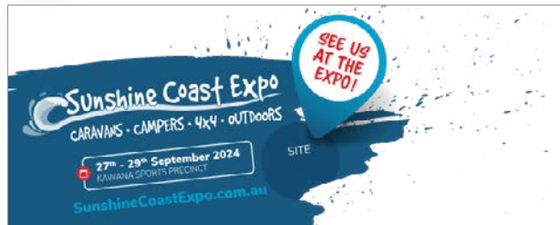
Email Signature Template 1